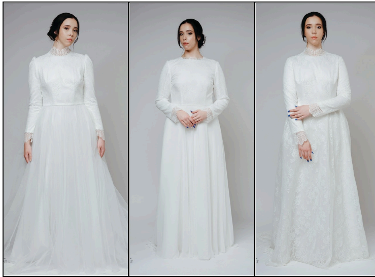
Diamond Lace, Tulle