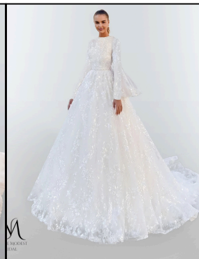
Cherisha Satin, Lace, Tulle