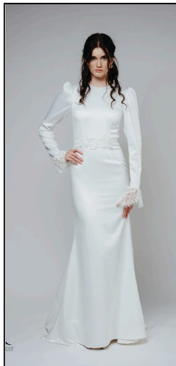
Style Satin, Lace