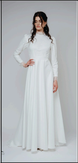
Beauty Satin, Lace