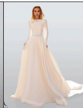
Hadassah Beading, Satin