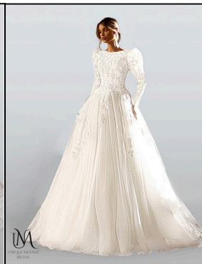
Glamera Satin, Lace, Tulle