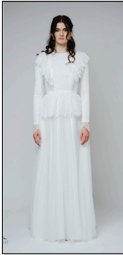
Bryony Lace, Tulle