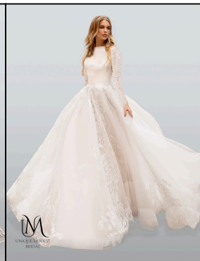
Timelessa Satin, Lace, Tulle