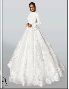
Bloomify Satin, Lace, Tulle