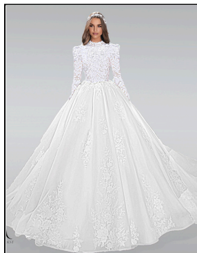
Aurora Satin, Lace, Tulle