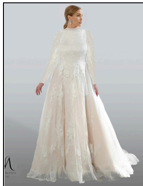
Chicella Satin, Lace, Tulle