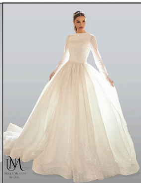
EternaChic Satin, Tulle