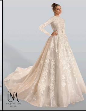
Serenara Beading, Satin, Lace, Tulle