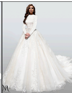
Veronica Satin, Lace, Tulle