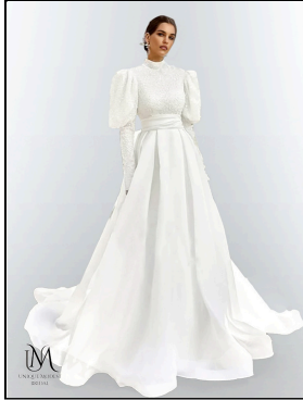
Opulique Beading, Satin, Lace