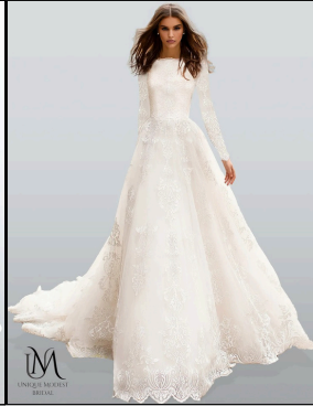
Elegara Satin, Lace, Tulle