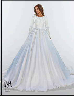
Radiantique Satin, Lace, Tulle