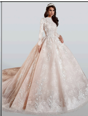
Eclara Beading, Satin, Lace, Tulle