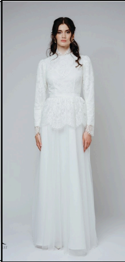
Gem Lace, Tulle