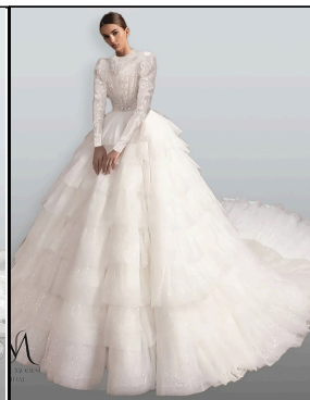
Splendorra Beading, Satin, Lace, Tulle