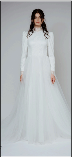
Diamond Lace, Tulle