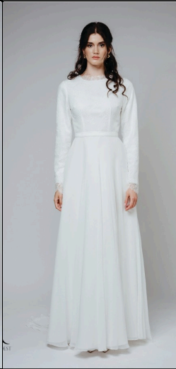
Ivy Lace, Chiffon